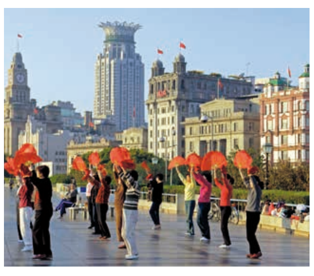
T'ai chi practised on the Bund, the Shanghai embankment

Next morning visit Shanghai University Dental School before taking a walking tour of the old heart of the city including Nanking Road, People's Square and the French Concession. There is the option of having dinner at Lost Heaven in the evening.