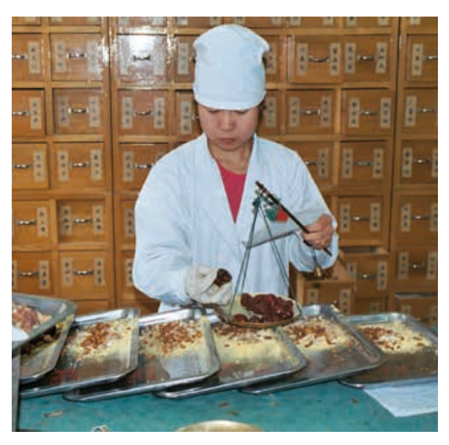
The Herbal Pharmacy at the Xi Yuan Hospital, Beijing

The next morning visit the amazing necropolis of the Terracotta Warriors, followed by a visit to the local medicine market in Xian, which has been selling its wares for hundreds of years, and also the Jade Market. There is the option to see a traditional performance of Tang Dynasty theatre later in the evening.