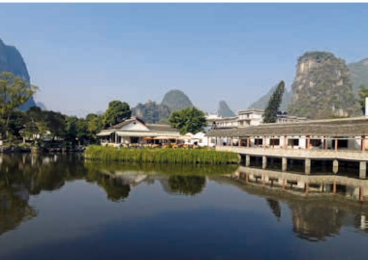
Modern Shanghai's skyline (top); the Summer Palace, Beijing; walk along the ancient city walls of Xian; the village of Yangshuo (above)