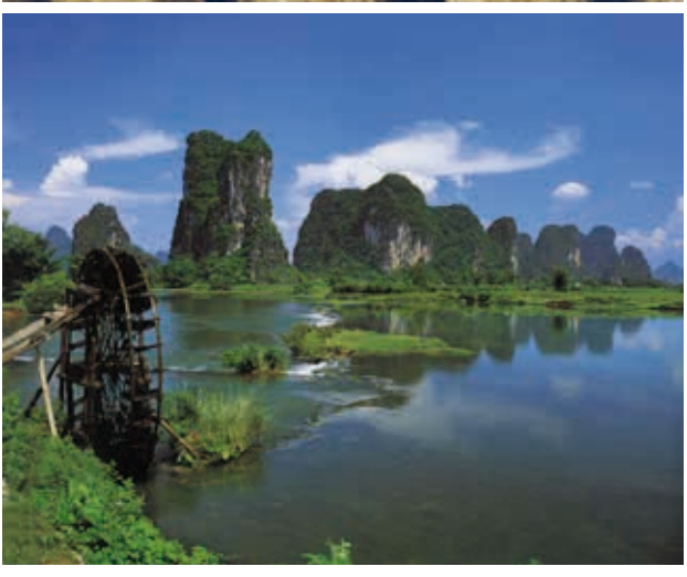
Beijing Acrobats (top); Terracotta Warriors; Cruise along the Li River to the village of Yangshuo (above)