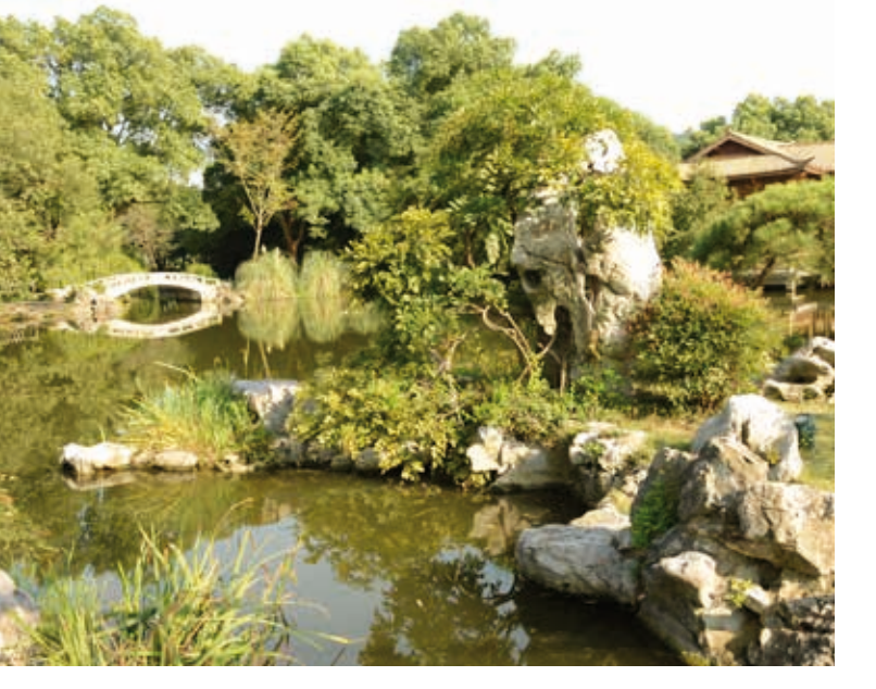
A traditional garden