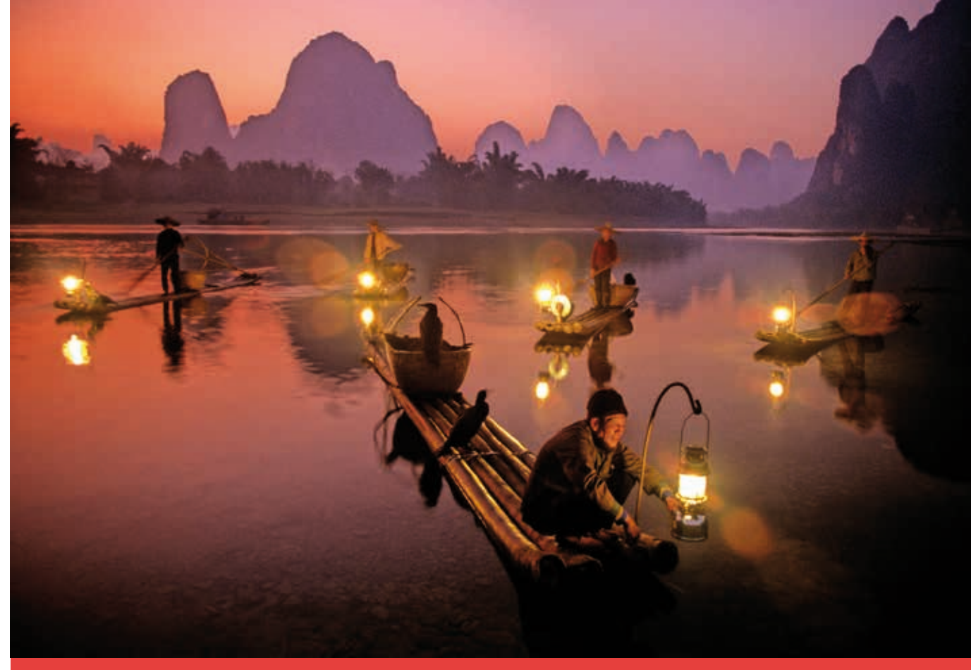
Cormorant fisherman on the Li River, Yangshuo