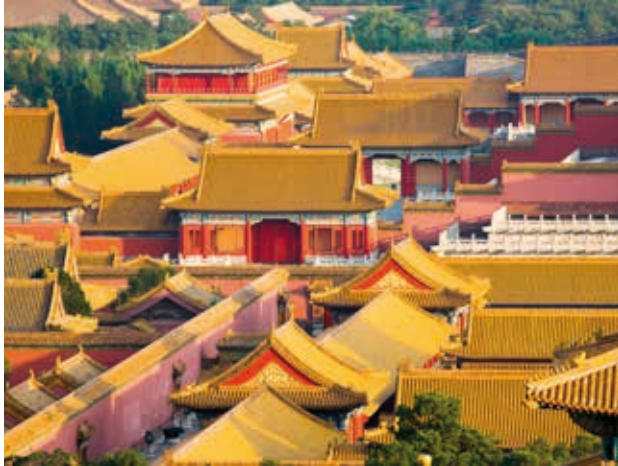
A canal in the water town of Suzhou (top); The burnished rooftops of the Forbidden City in Beijing (above)

Next morning drive to the exquisite 2,500 year old town of Suzhou. Visit its beautiful traditional gardens and one of the city's famed silk workshops, where contemporary designers use traditional methods. In the evening take a cruise along one of Suzhou's many canals and stay overnight.