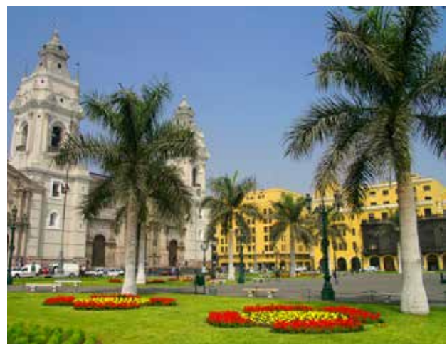
Plaza del Armas, Lima

The next day visit the San Martin de Porras University Dental Clinic and meet with staff and students to learn about dental training in Peru. Fly to Arequipa, Peru's second city, a spectacular