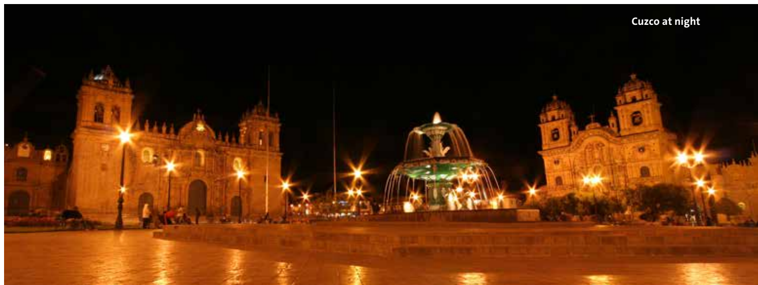
Cuzco at night