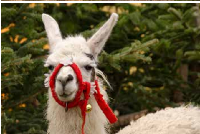
Lima (top); Santa Catelina Convent, Arequipa; Lake Titicaca; Llama (above)