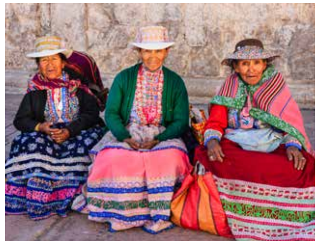
Uros Islands, Lake Titicaca (top); Peruvian women (above)