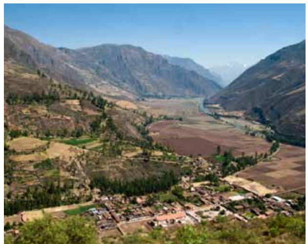
Main Square, Cuzco (top); Sacred Valley (above)