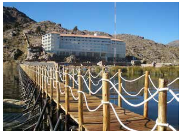
Posada Del Inca Hotel, Arequipa (top); Jose Antonio Hotel, Puno (above)